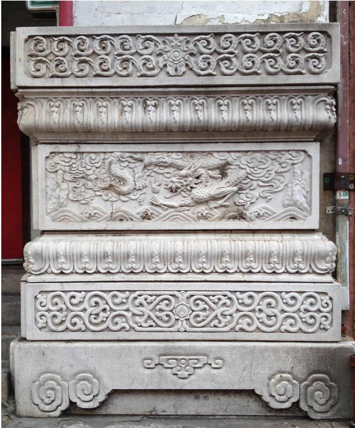
Figure 10. Detail of the South Bas- Relief