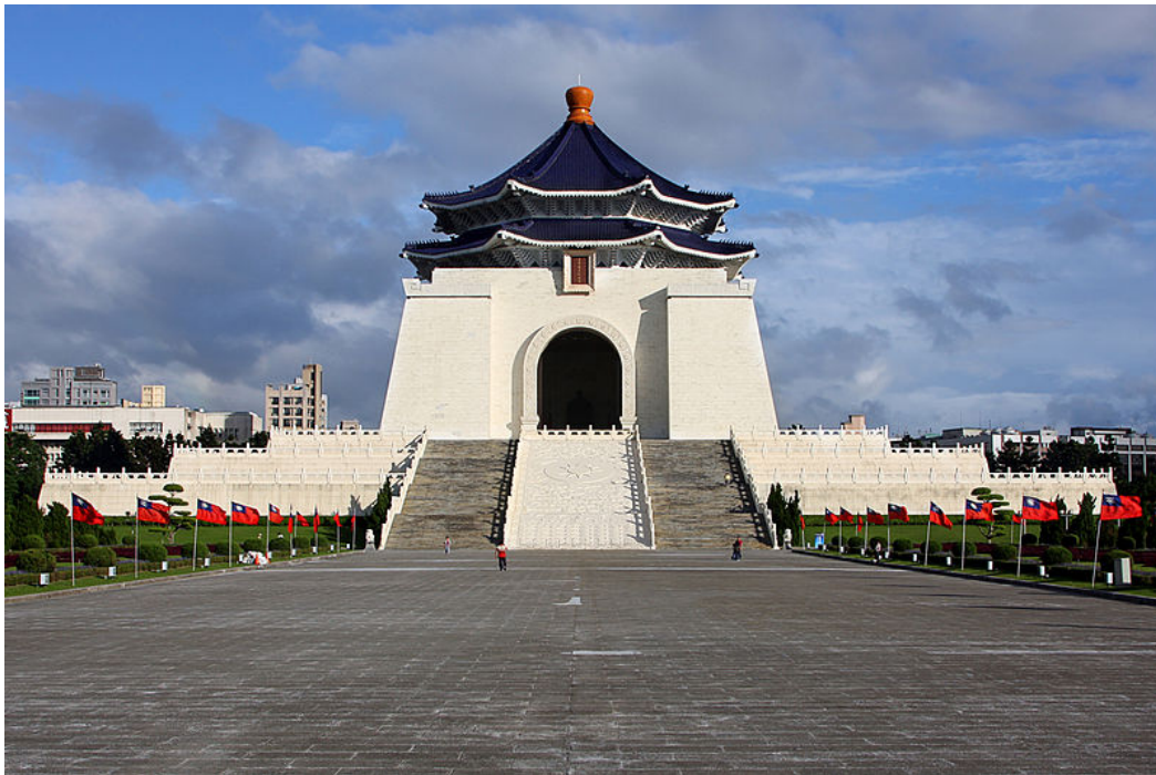
Figure 21. Chiang Kai-shek Memorial Hall