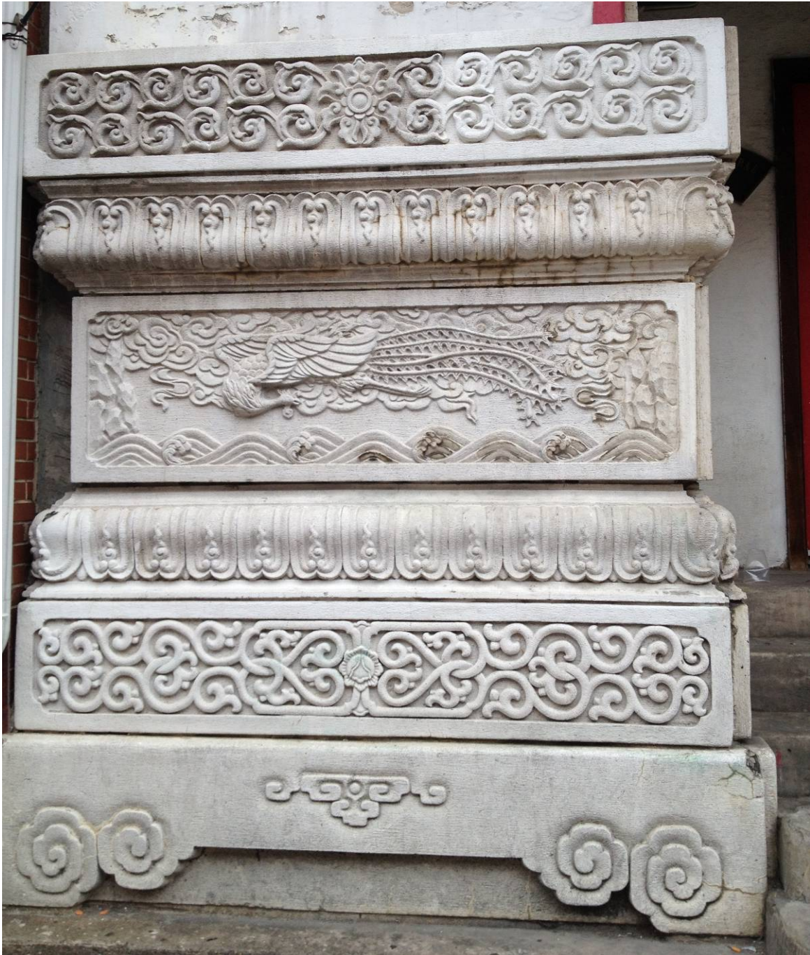
Figure 9. Detail of the North Bas- Relief