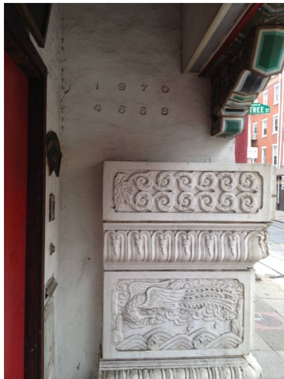
Figure 6: Southern Wall of Porch