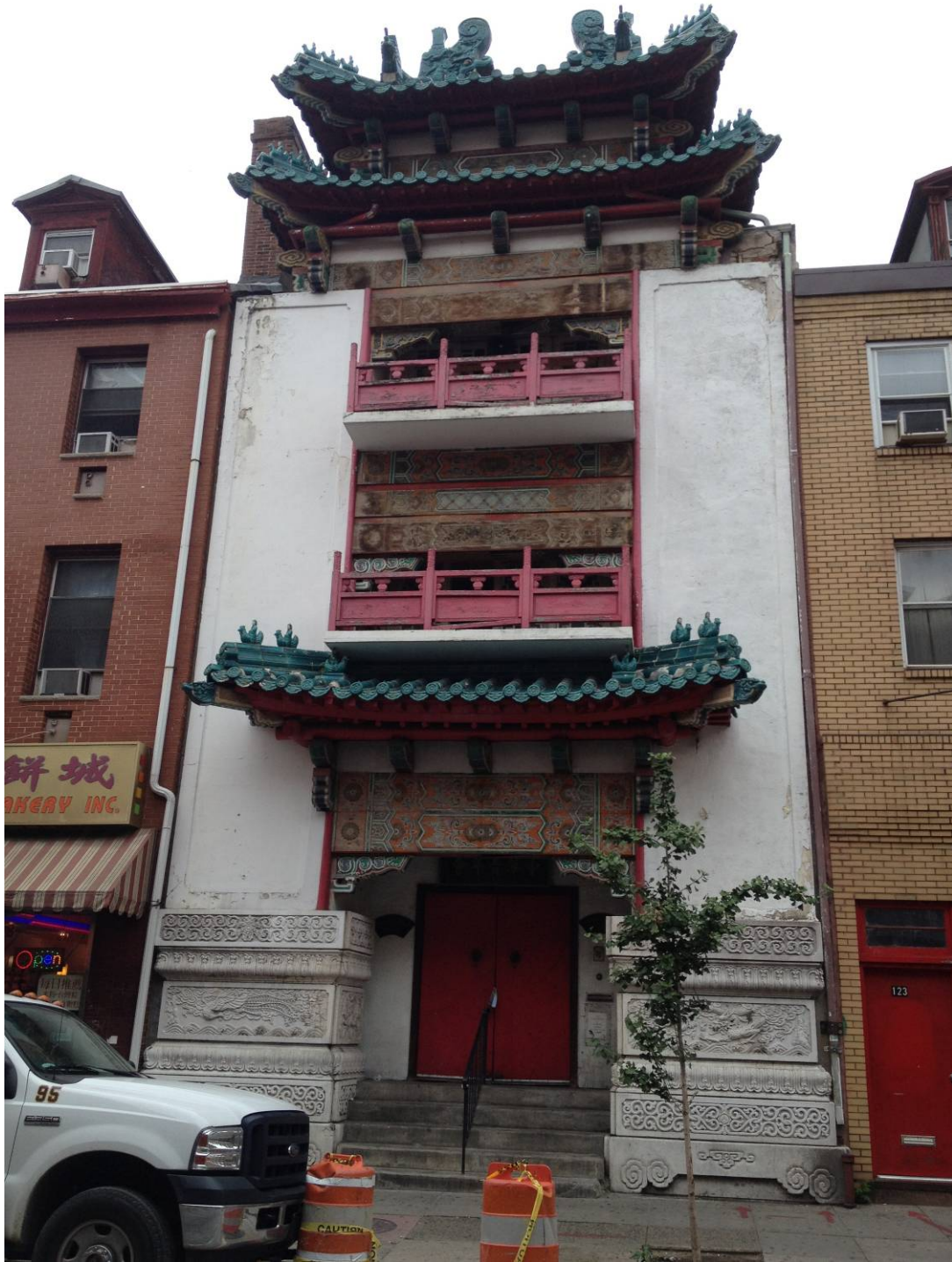
Figure 2. Northern Elevation of 125 N. 10 th Street