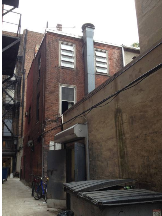
Figure 14. Rear Building of 125 N. 10 th Street.