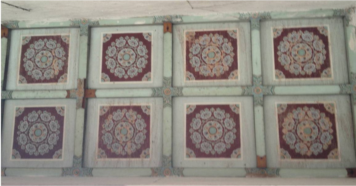
Figure 7. Detail of Porch Ceiling