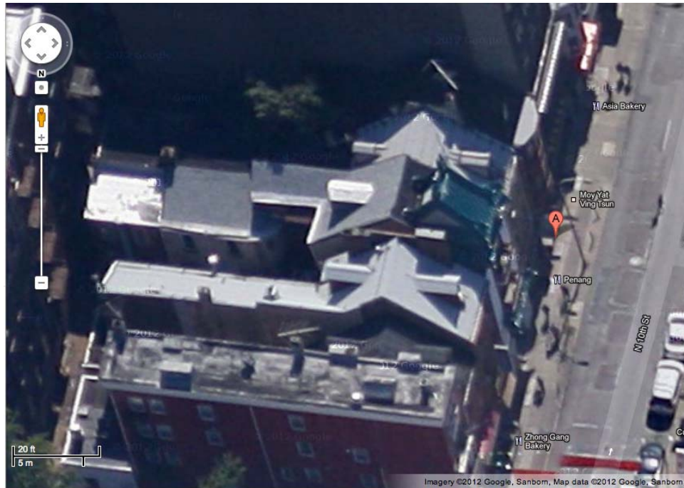
Figure 3. Partial South Elevation