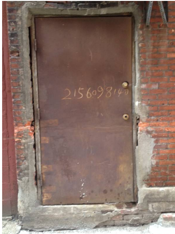
Figure 15. Detail of Metal Door on the Rear Building's South wall.