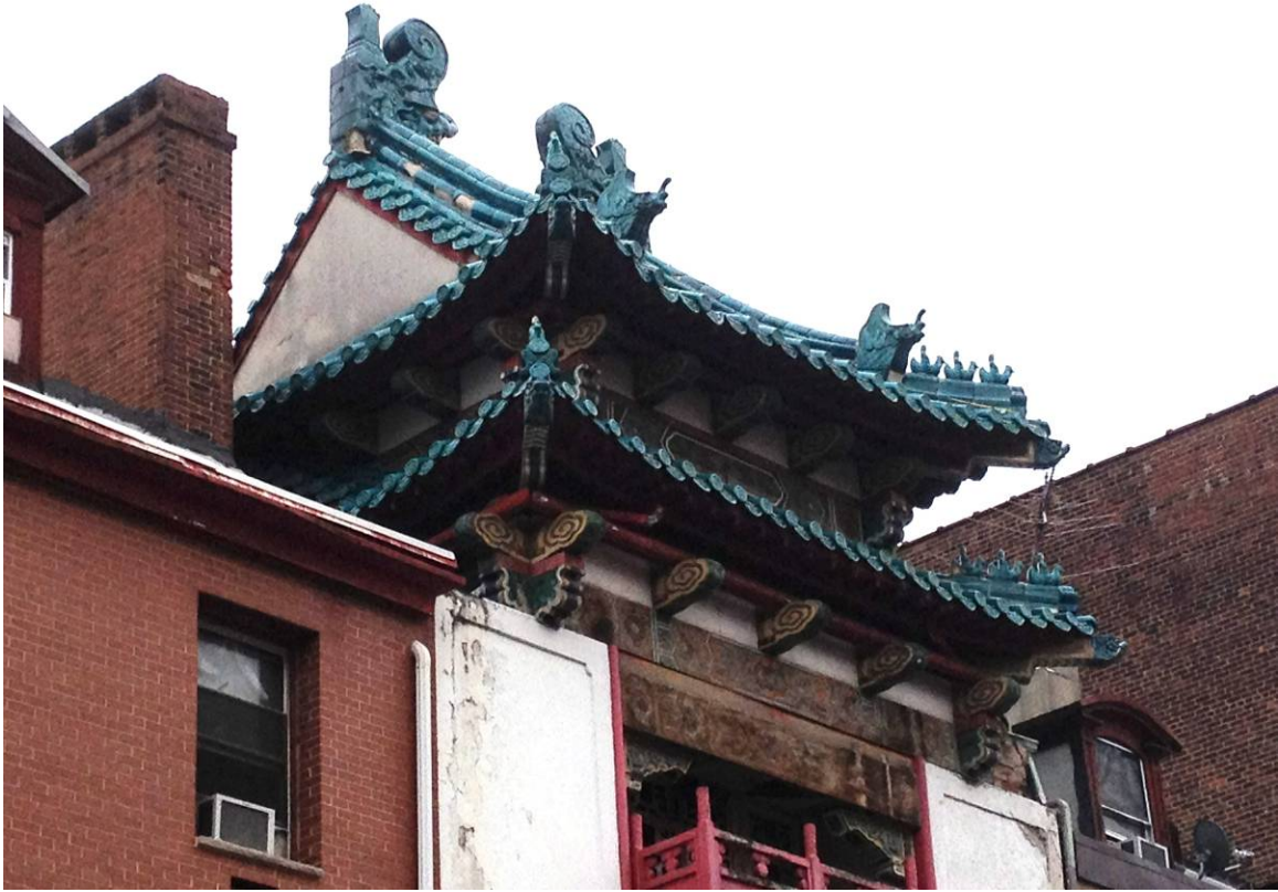
Figure 12. Detail of Penthouse