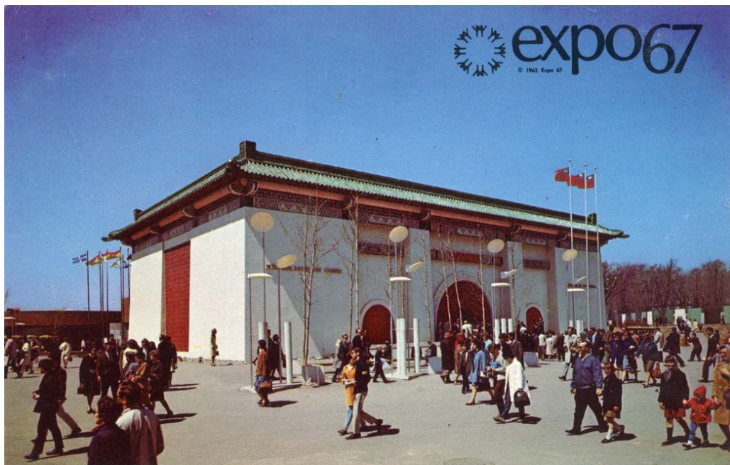
Figure 19. China's Pavilion at the 1967 World Expo