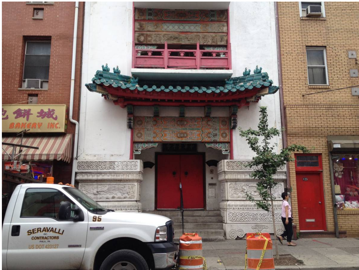
Figure 8. Building's First Story