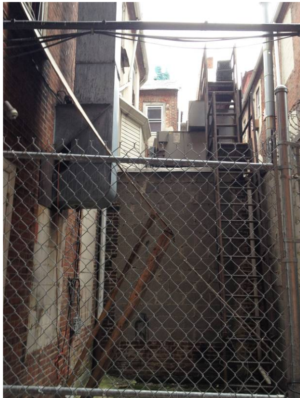
Figure 17. East Elevation