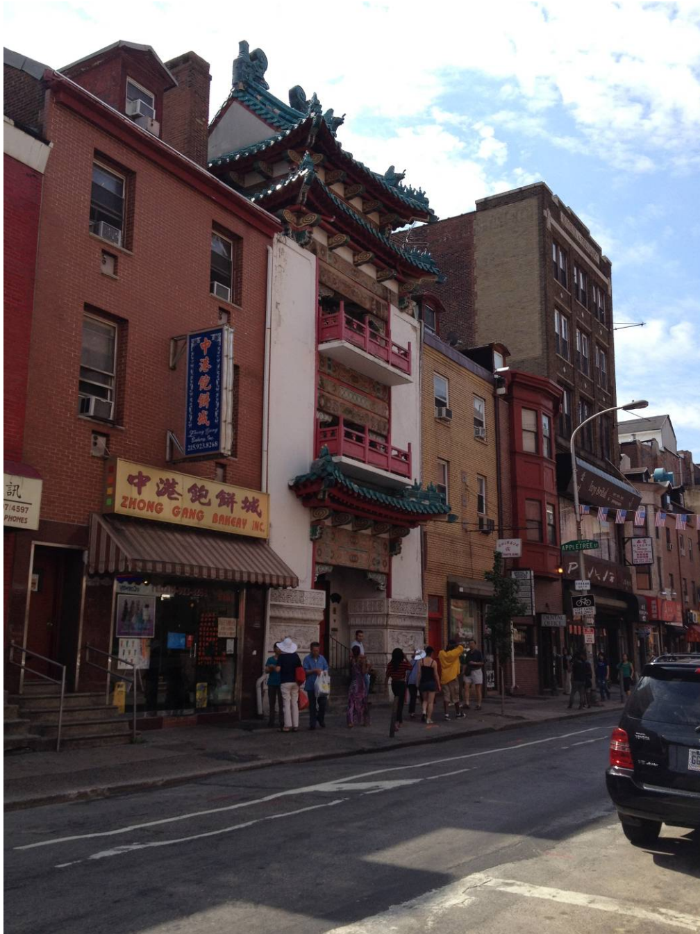
Figure 1. Perspective looking south on 100 Block of North 10 th Street.