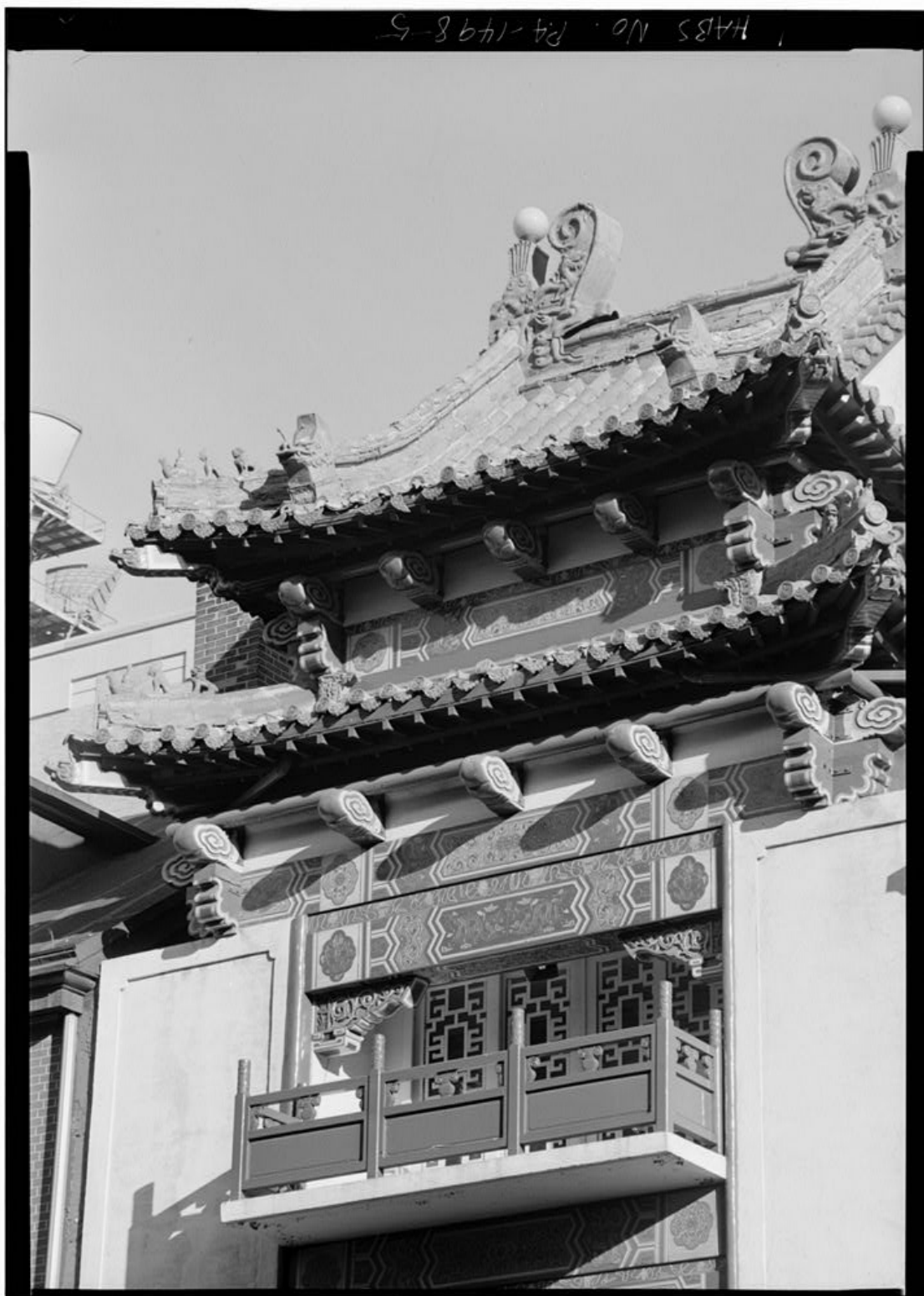
Figure 13. Detail of Third Story and Penthouse (Source: Historic American Buildings Survey, 1974) http://www.loc.gov/pictures/item/pa1151.photos.137982p/resource/