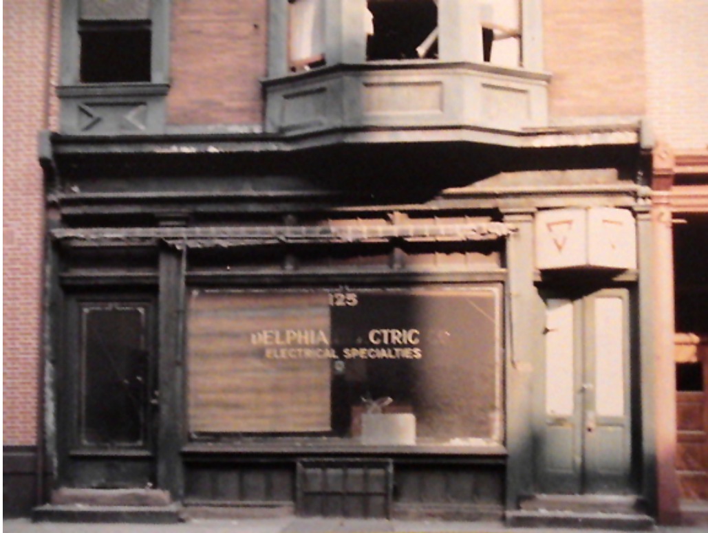
Figure 18. Detail of 1 st Story West Elevation before 1971 Renovation