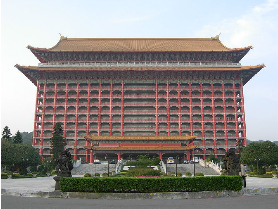
Figure 20. Taipei Grand Hotel