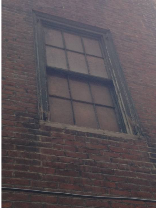
Figure 16. Detail of Wooden Double Hung Windows