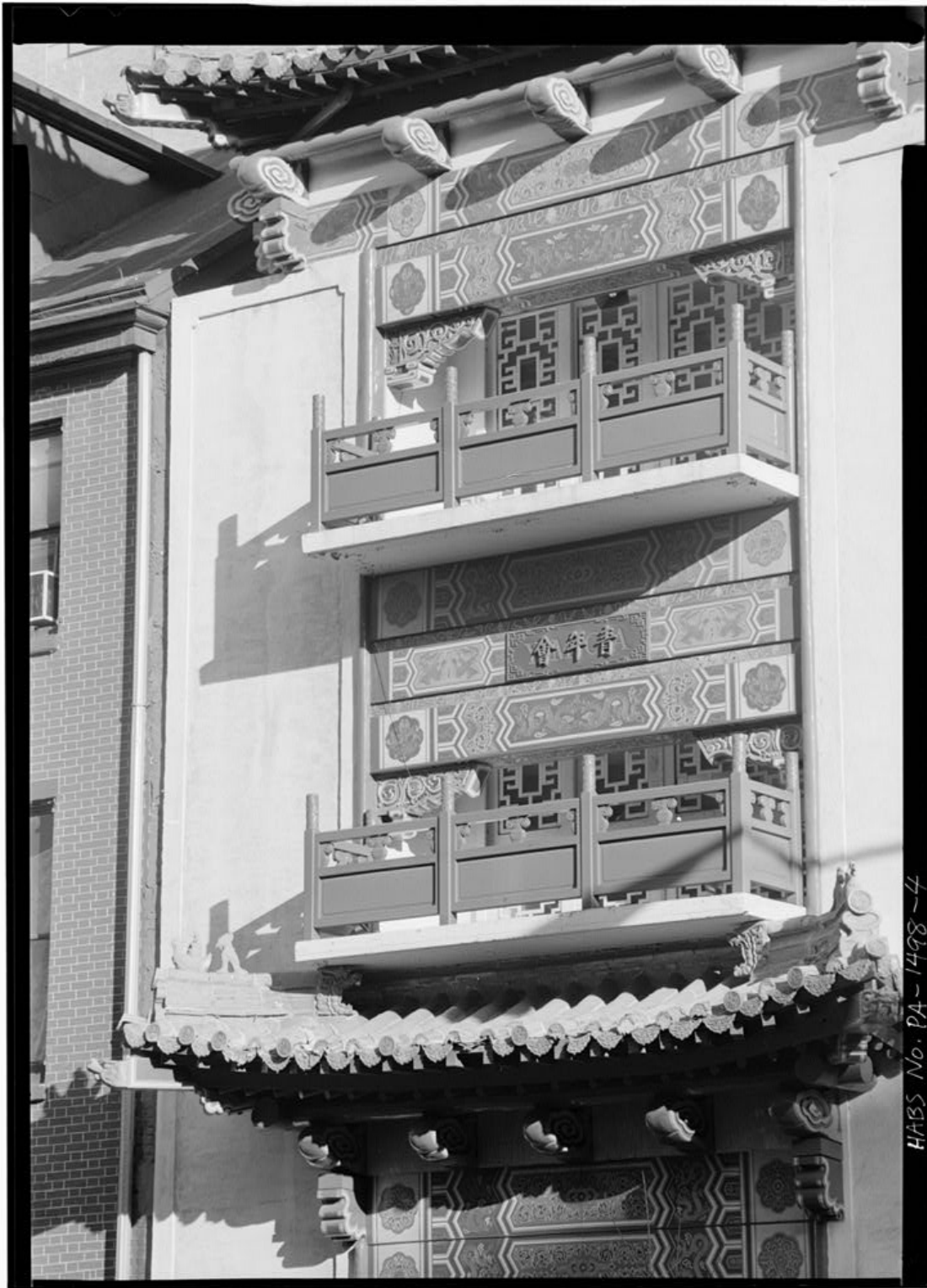
Figure 11. Detail of Second and Third Stories (Source: Historic American Buildings Survey, 1974) http://www.loc.gov/pictures/item/pa1151.photos.137981p/resource/