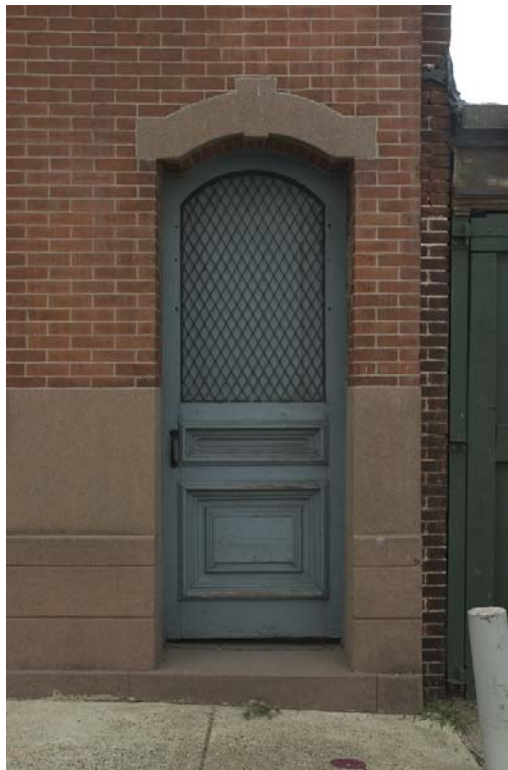
Figure 6: East elevation auxiliary door