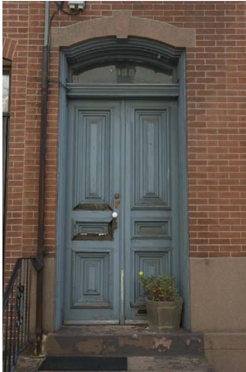
Figure 5: East elevation main door