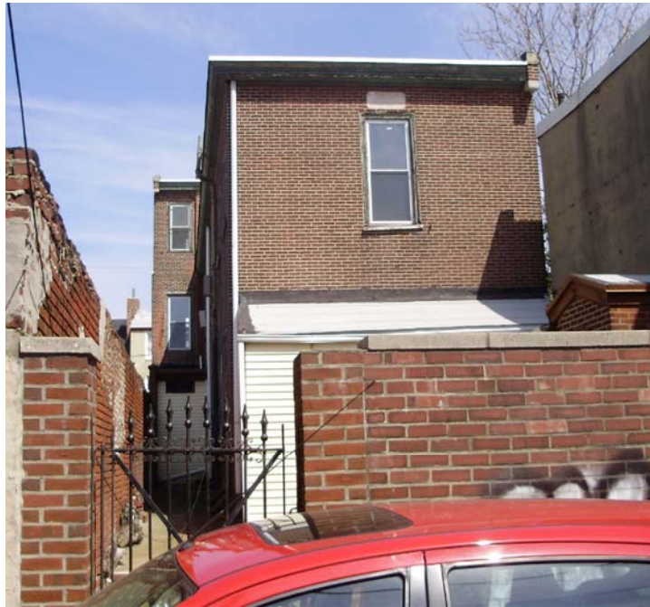
Figure 3: West (Day Street) elevation