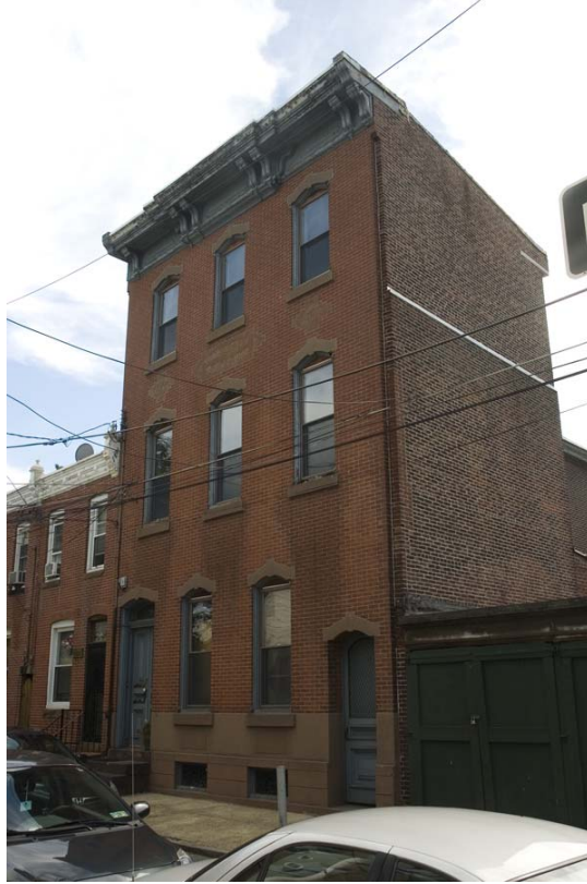
Figure 1: East (Crease Street) elevation and partial north elevation