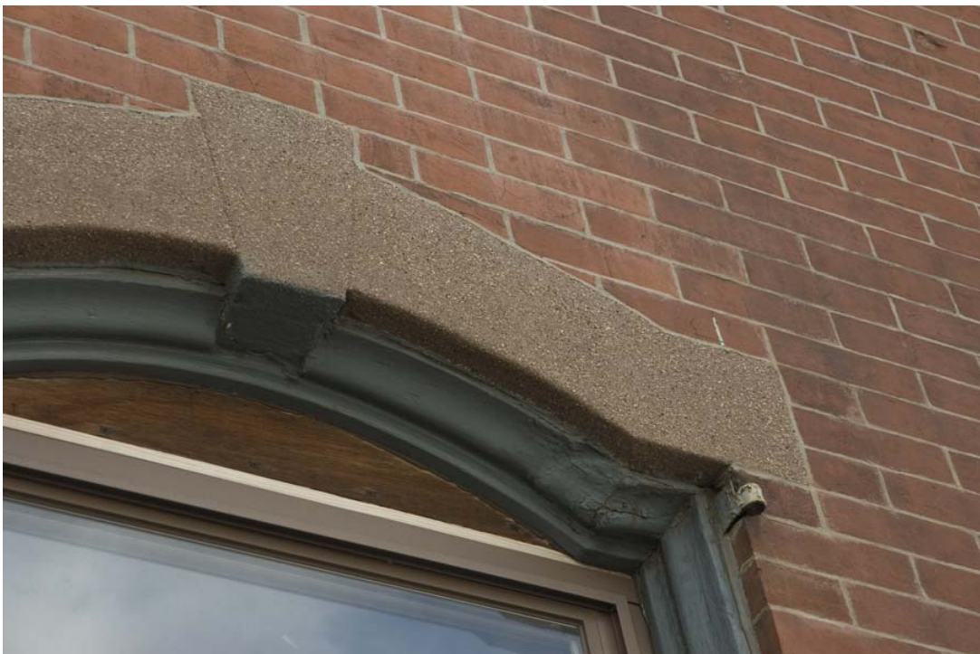
Figure 8: East elevation lintel, brickmold, and window detail