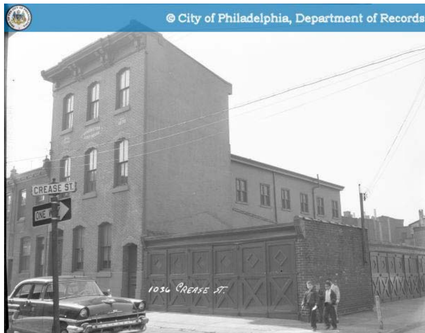
Figure 12: Undated historic photo, c. 1950