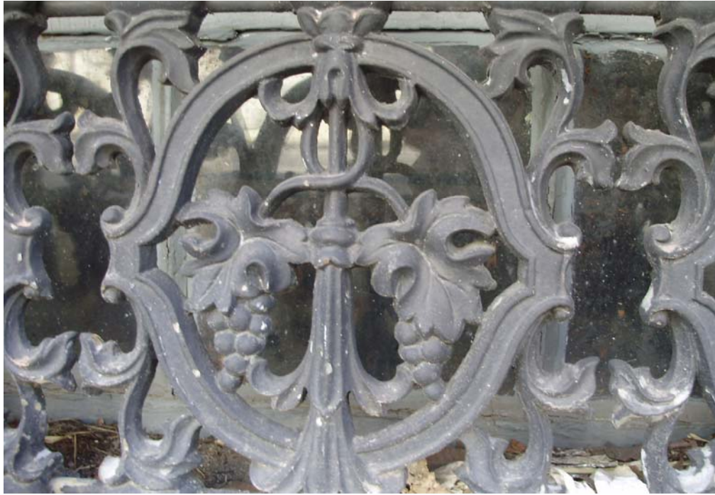
Figure 9: East elevation basement window grill detail