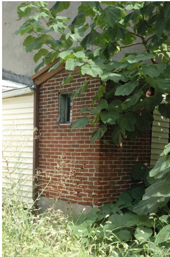
Figure 10: West elevation rear outbuilding detail