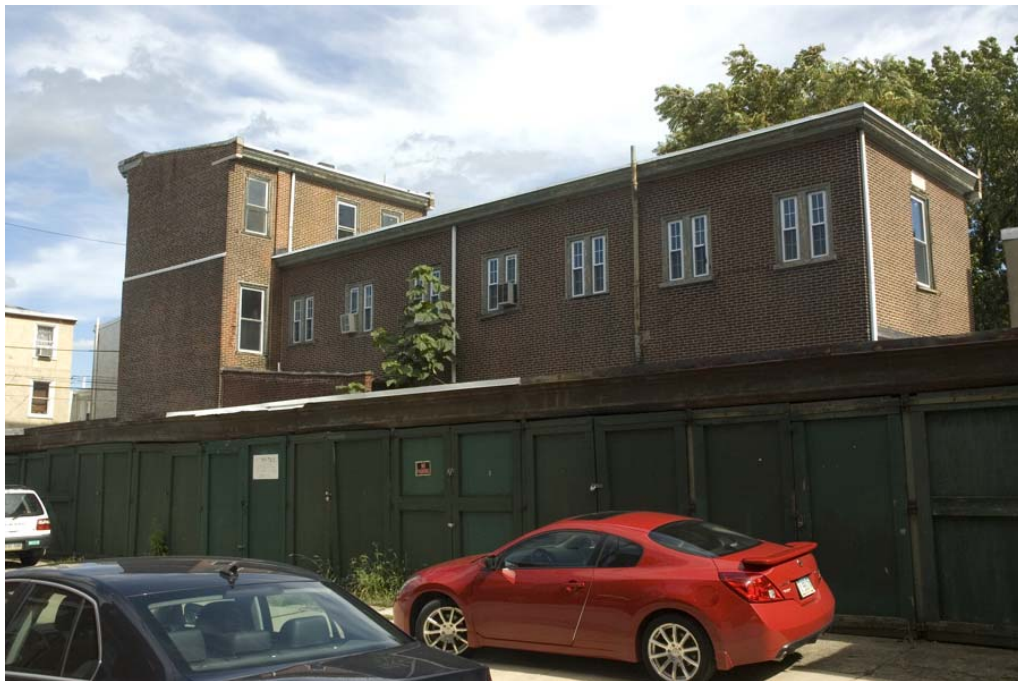
Figure 2: North and partial west elevations