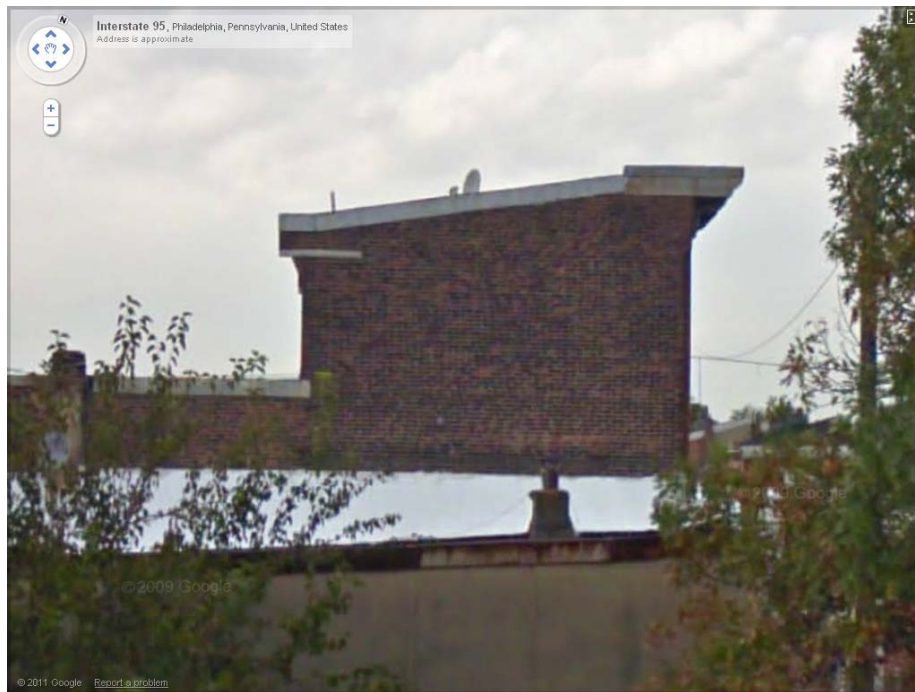
Figure 4: Partial south elevation