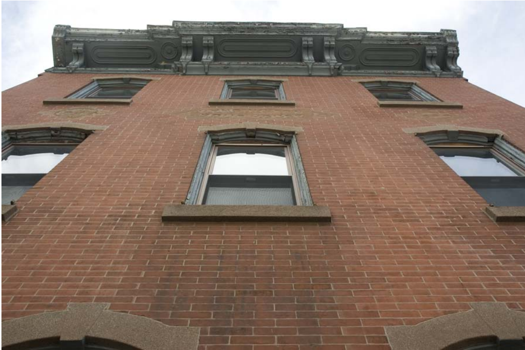
Figure 7: East elevation cornice and window detail