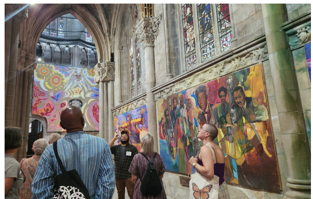
Going Uptown Neighborhood Walking Tour