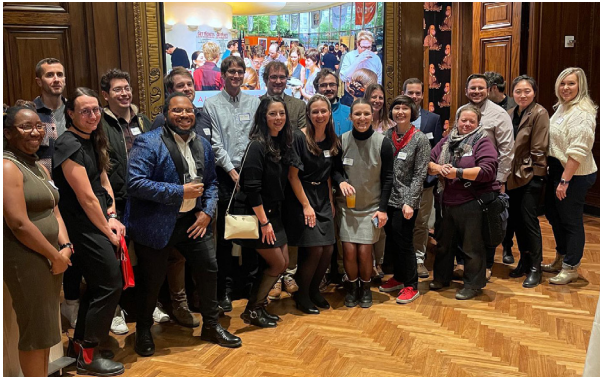
YFPA Alumni at In With The Old Celebration at the Duke & Duke Boardroom